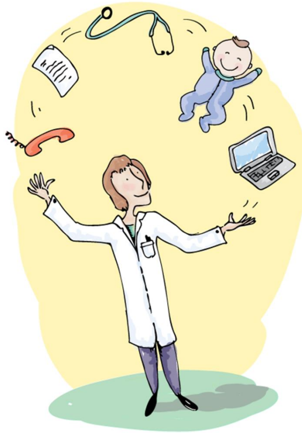
The Manager Role CanMEDS-FM